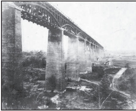
High Bridge in 1865.

been restored. The house is open most days April-October and by appointment. Construction of a visitor center at Sailor's Creek is underway. An opening date is not yet scheduled.