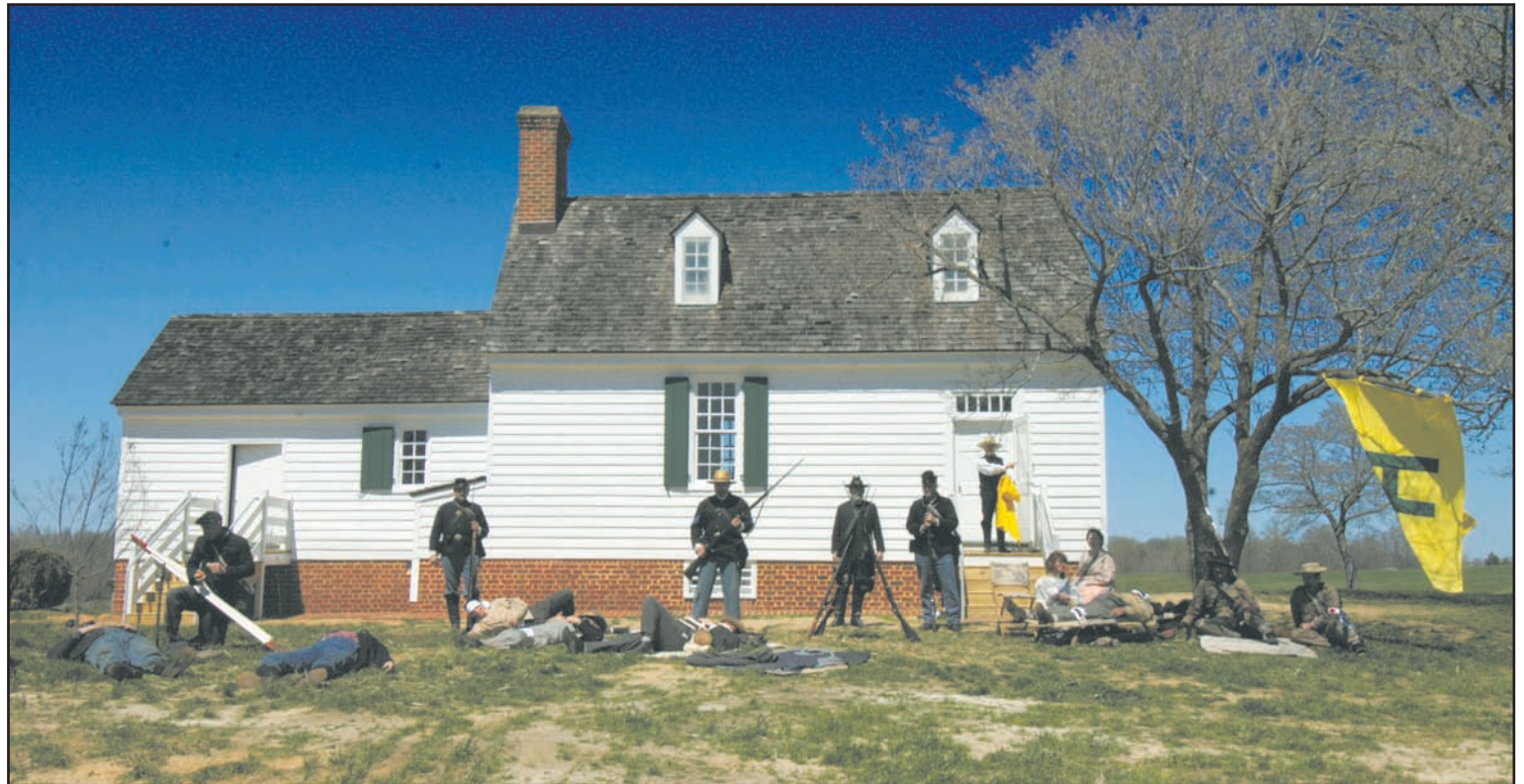
Living history at Hillsman House on the Sailor's Creek battlefield.