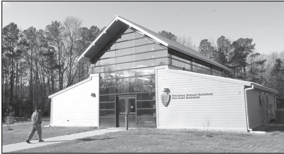
New visitor station at Five Forks.

Long inaccessible to any kind of (legal) visitation, the site of the historic High Bridge is now accessible via the