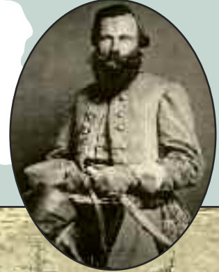
Confederate cavalry commander J.E.B. Stuart (inset) was mortally wounded during the Battle of Yellow Tavern, May 11, 1864.