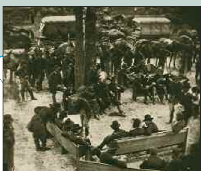
One of a series of photographs by Timothy O'Sullivan of a Union High command meeting at Massaponax Church, U.S. Grant is leaning over a church pew conferring with his commanders.