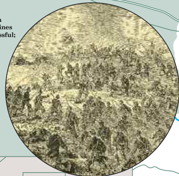
The first Union attacks on thinly held Confederate lines at Petersburg were successful, but resistance stiffened resulting in a siege.